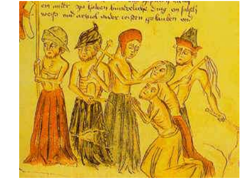
People dying of plague (note the buboes).

Flagellants hoping to escape the Black Death