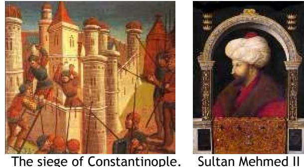
The siege of Constantinople.

The siege lasted for fifty days, after which the city was overtaken by the Turks. It was now officially claimed for Islam and renamed Istanbul. The remaining Christians were allowed to practice their religion, but had to dress in distinguishing attire and could not bear arms.