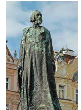
Statue of Huss in Central Prague